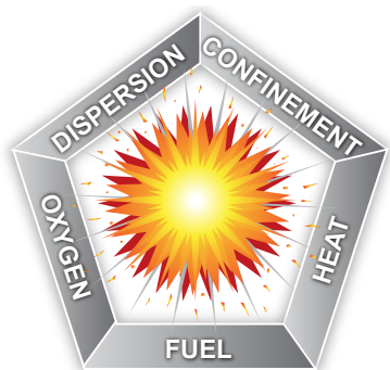
Dust Explosion Pentagon